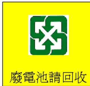
Figure 1-1 Taiwan Battery Warning

The Taiwan EPA requires dry battery manufacturing or importing firms in accordance with Article 15 of the Waste Disposal Act are required to indicate the recovery marks on the batteries used in sales, giveaway or promotion. Contact a qualified Taiwanese recycler for proper battery disposal.